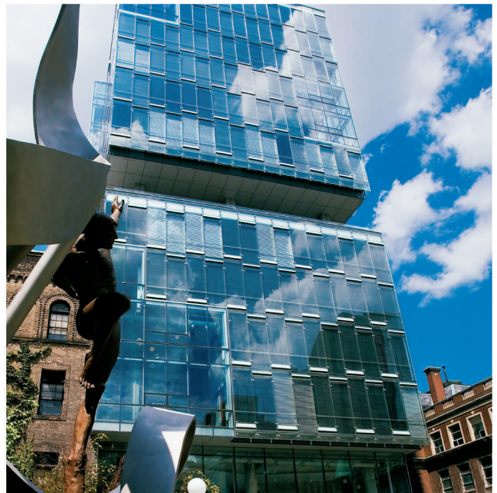
University of Toronto, Terrence Donnelly Centre for Cellular and Biomolecular Research Toronto, Ontario ARCHITECTS architectsAlliance, Toronto, Ontario Behnisch Architekten, Stuttgart, Germany and Los Angeles, California GLAZING CONTRACTOR Ferguson-Neudorf Glass, Inc., Beamsville, Ontario

Solvent-free powder coatings add the green element with high performance, durability and scratch resistance that meet the standards of AAMA 2604.